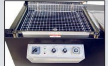
Dual Magnet Hold Down During Seal Cycle.

Now Available in 110 or 220 Volt For Higher Performance and Lower Operating Costs